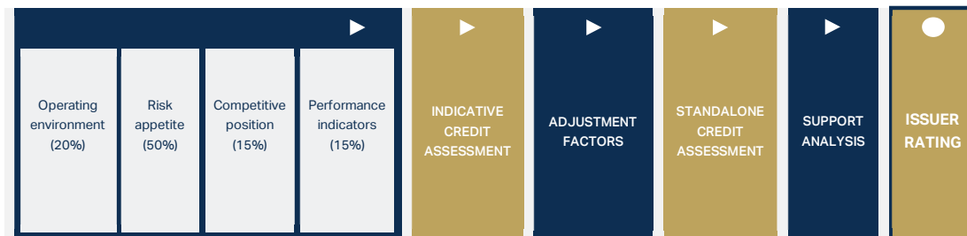
Figure 1. NCR financial institutions rating framework

Our financial institutions ratings are forward-looking assessments that incorporate macroeconomic conditions, key risk appetite strategies and management, competitive position, and key earnings and loss performance indicators. Together, these qualitative and quantitative analyses result in an indicative credit assessment. The indicative credit assessment can be "notched" up or down, taking into account adjustment factors. These are primarily due to peer comparisons with rated entities at similar rating levels, but they also reflect material risks, transitions or market impacts not otherwise captured in the indicative credit assessment. Lastly, we review the support structure for the rated entity, whether material credit-enhancing partner alliances or the credit implications of the shareholder structure, and if required, we apply necessary rating caps.